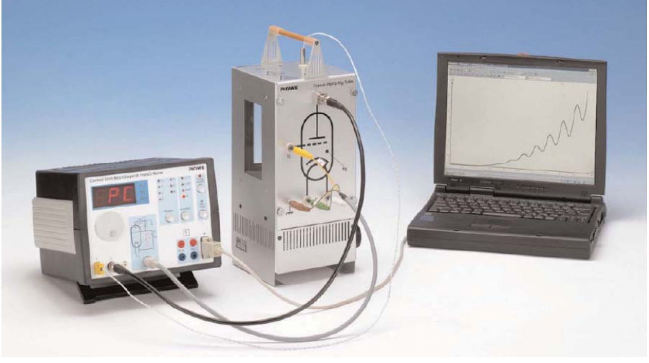
Fig.1: Set-up for the Franck-Hertz experiment with PC.